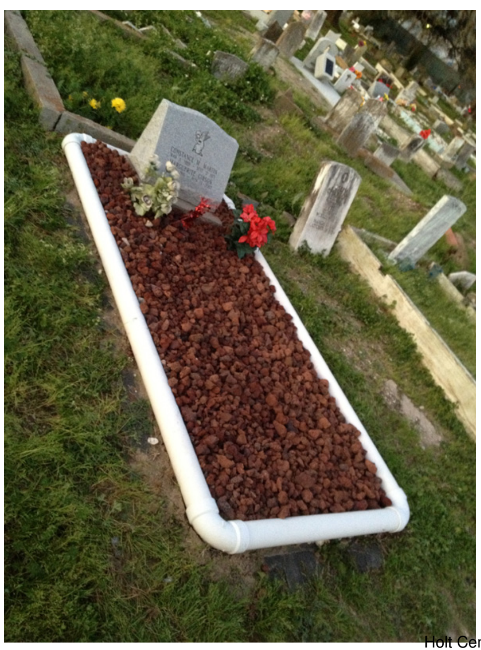
Holt Cemetery It was

absolutely surreal to wander about these cemeteries as the day gave way to complete darkness, often with only the moonlight to guide our way. This experience is a MUST. It takes you away from the French Quarter and out into a completely different area, while still remaining easily and quickly accessible via streetcar.