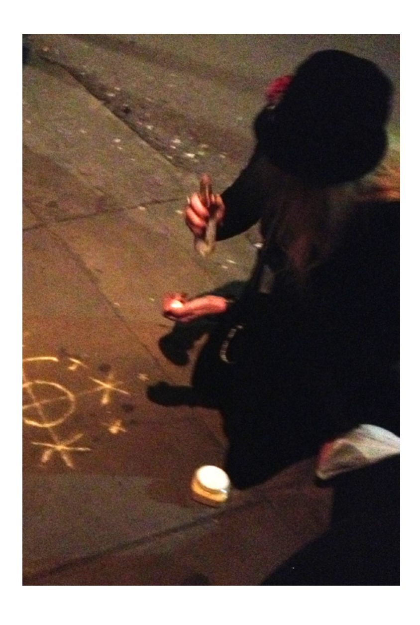
Gina, Tour of the Undead guide, performing a ritual This was, refreshingly, like no other French Quarter walking tour I have