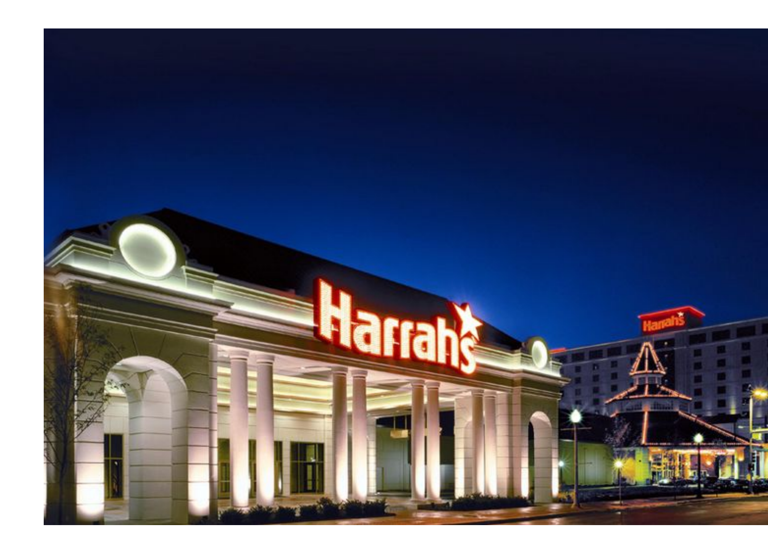
By Angela Ash