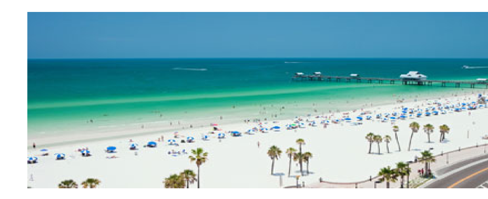
By Angela Ash

Positioned on the west coast of Florida is gorgeous Clearwater Beach. With pristine white sand beaches and clear waters (hence the name) on the Gulf, this is one of the most beautiful destinations in the world!