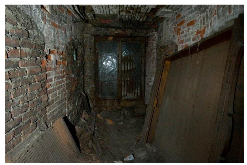
Do you want a special, one of a kind experience? Salem Smugglers' Tour

This above ground tour of the history of the tablets goes over their creation by a series of federal politicians who wanted to avoid paying duties on imports in 1800. Engineered by the son of America's first millionaire and built by the descendants of the first National Guard unit in the country. Take this hour and half <a href="Salem history tour">Salem history tour</a> through the city and see one of a kind photos of the tunnels on our tablet as we walk over them. Along the way you will also hear tales of pirates, murder, and ghosts!