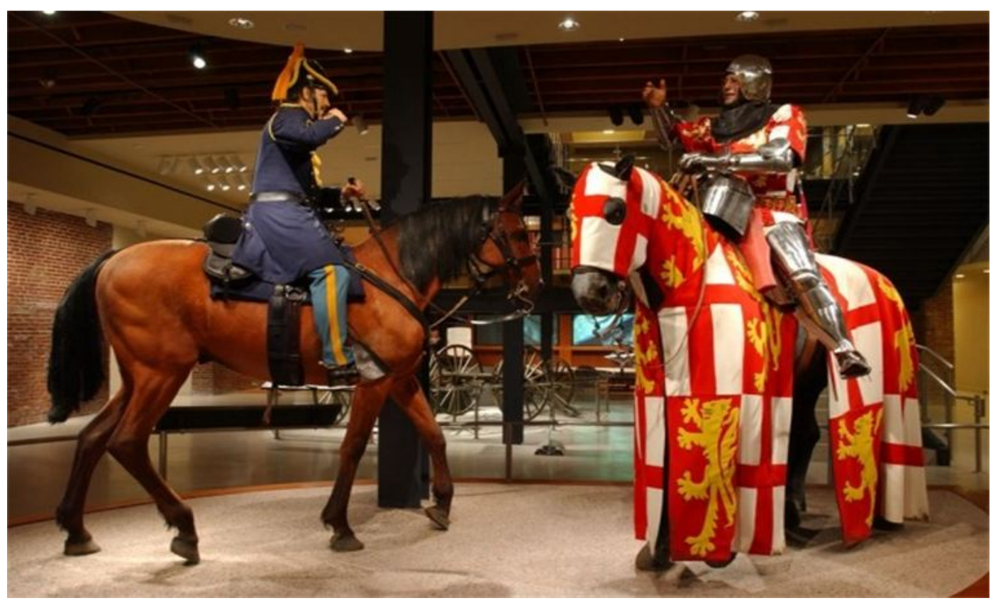
This amazing city hosts a vast array ofwonderful museums, including the Frazier History Museum

, where history literally comes alive through interactive exhibitions, stations, and even live lectures and historical interpretations. They also offer special exhibitions.