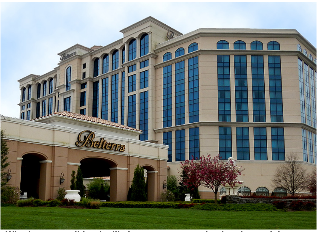
Whether you call Louisville home or are merely planning a visit, you are in for an adventure!